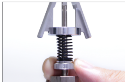
Adjustment screw of clamping force