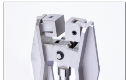
Grip face along with specimen surface