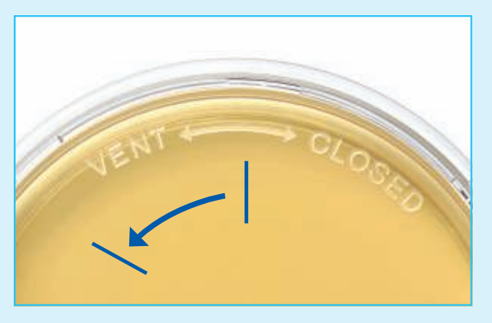
Turn lid counter clockwise and click in VENT-position