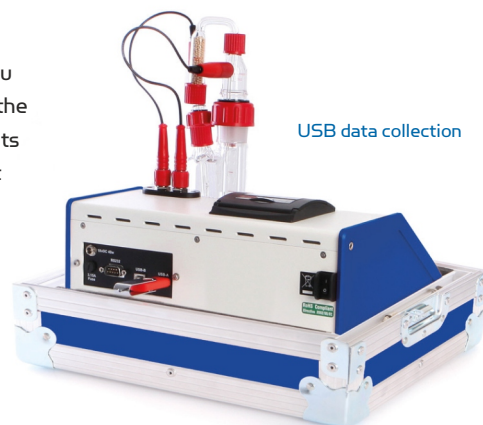
USB data collection

This is a windows application that allows you to view and print sets of results created by the Aquamax KF Titrator. It can download results directly from the instrument via a serial port connection, or open result files previously saved to disk. The Results Manager package contains all necessary cables, connections, installation cd and user manual.